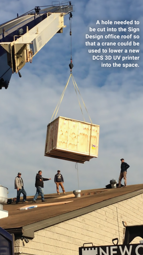
A hole needed to be cut into the Sign Design office roof so that a crane could be used to lower a new DCS 3D UV printer into the space.