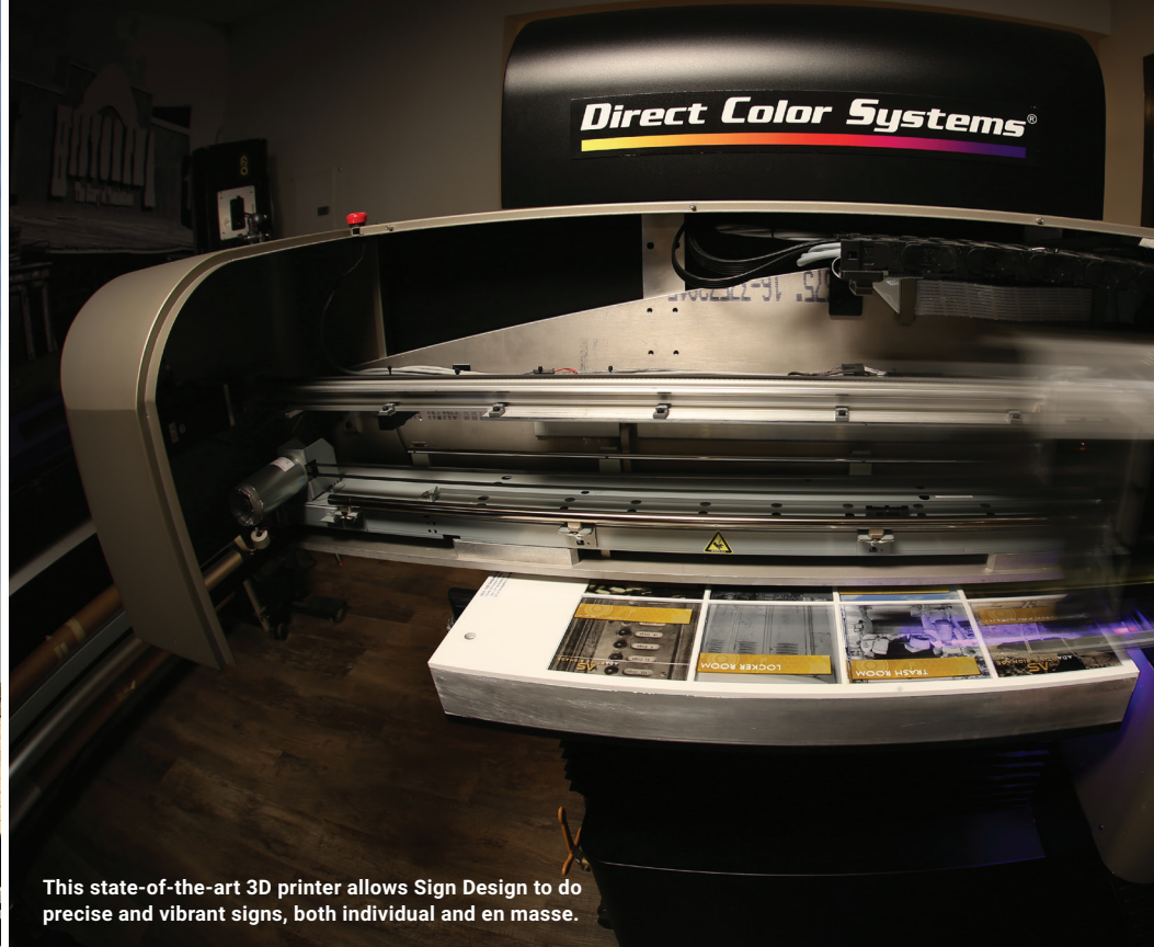
This state-of-the-art 3D printer allows Sign Design to do precise and vibrant signs, both individual and en masse.